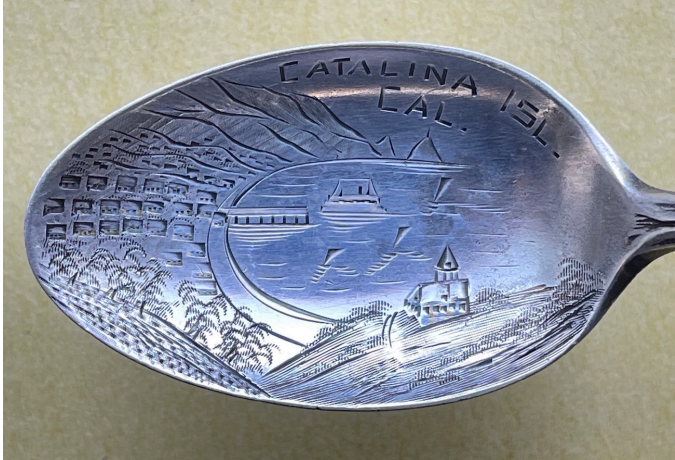
on Watson #311 - figural fish